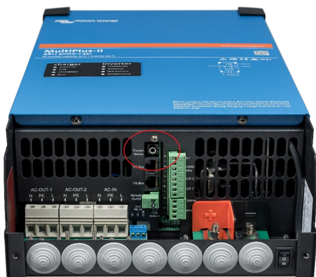
Picture of the connections of the MultiPlus-II. Encircled the Current Sense socket.

Step 4: Turn the unit 'On' and check on your GX device and/or on the VRM dashboard to see if the AC-input current is showing the correct values.