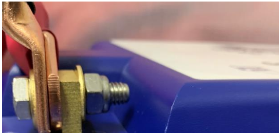
Proper Connection: Longer bolt used with multiple lugs can fully seat into nylon insert of nut without interfering with battery case

WHEN CONNECTING TO BATTERY TERMINALS, DO NOT FINGER TIGHTEN. ALL CONNECTIONS MUST BE TIGHTENED TO THE SPECIFICATIONS OF THE BOLT MANUFACTURER. FOR THE BOLTS INCLUDED WITH THE BATTERY, TIGHTEN USING A TORQUE WRENCH TO BETWEEN 9 AND 11 ft-lbs. FAILURE TO ADEQUATELY SECURING CONNECTIONS CAN RESULT IN FIRE.