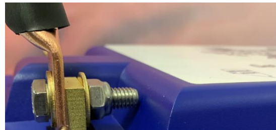
Improper Connection: One lug used with longer bolt creates interference with battery case